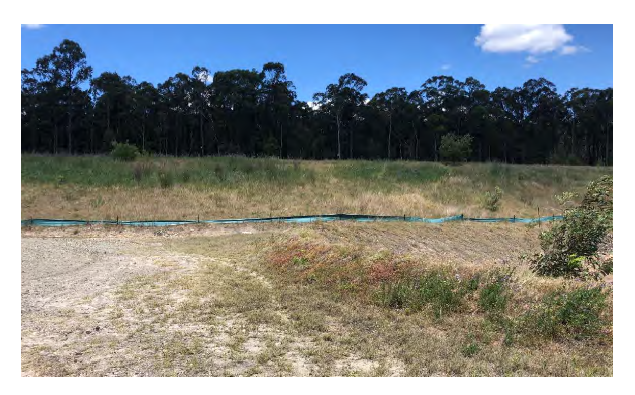
Photo 15 Possible consideration of clean water catchment at Kitchener SIS to reduce catchment reporting to the sediment dams. Successful rehabilitated area evident