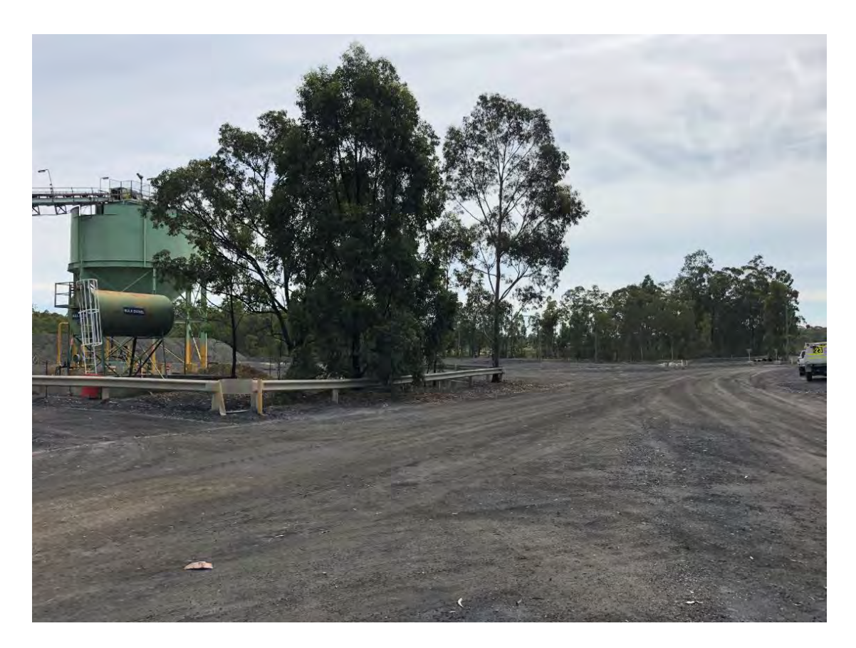
Photo 7 No evidence of significant dust during care and maintenance operations