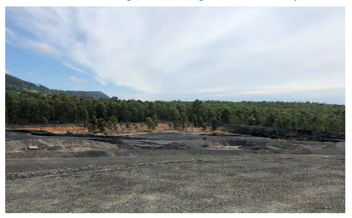
Photo 8 No evidence of significant dust during care and maintenance operations