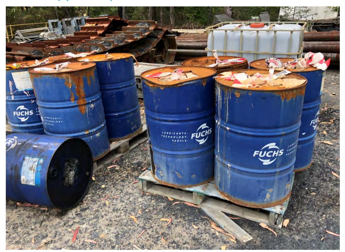
Photo 6 Some empty drums at CHPP laydown not stored in empty drum area