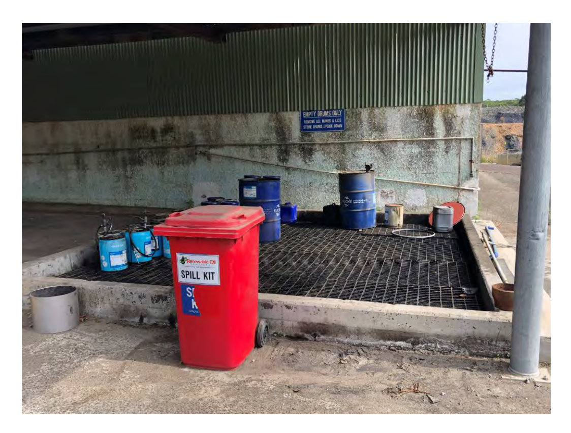
Photo 3 Generally good hydrocarbon management with containers in appropriately bunded areas