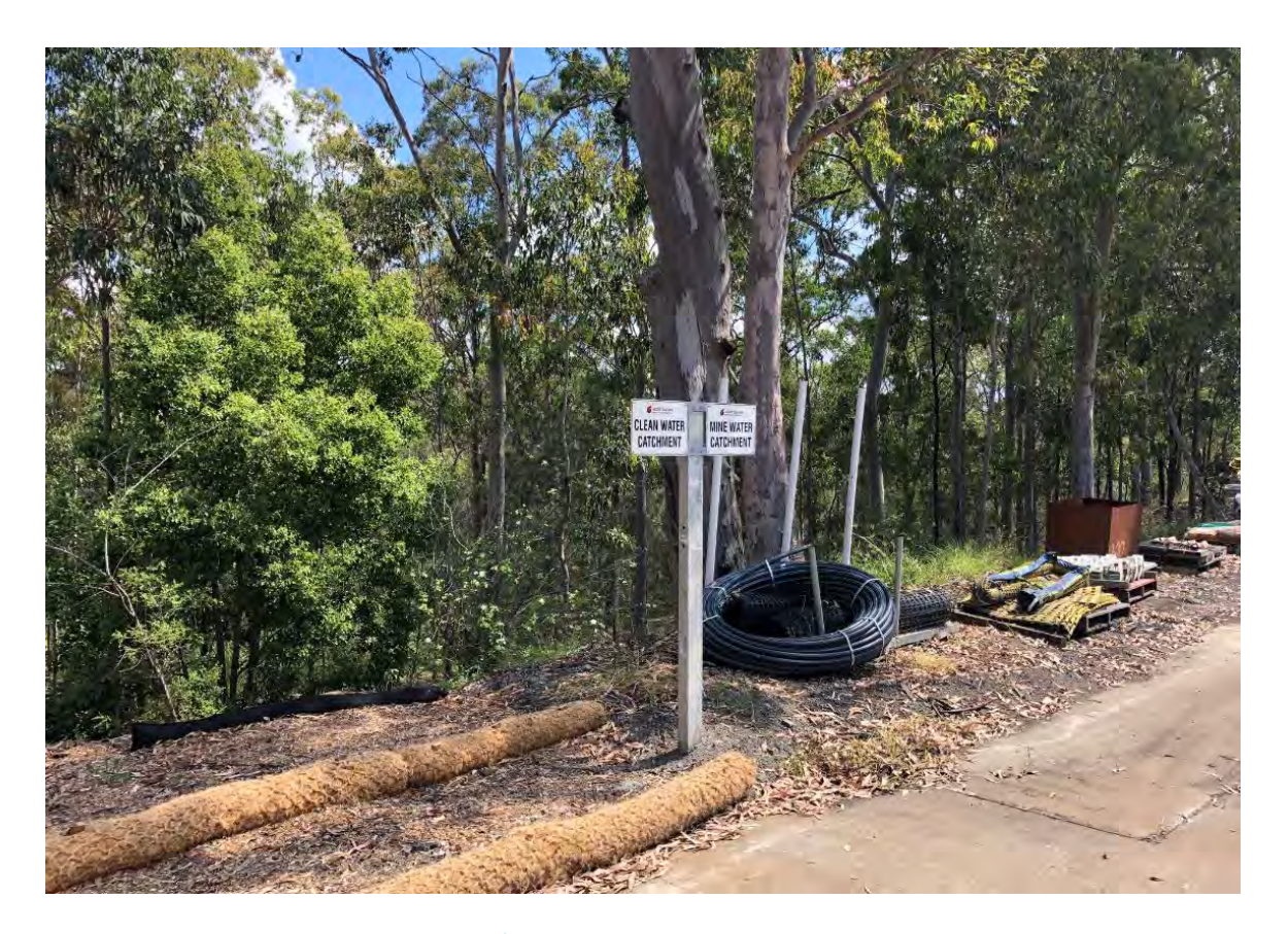
Photo 16 Implementation of Clean/Dirty Water Catchment at Pit Top following previous audit