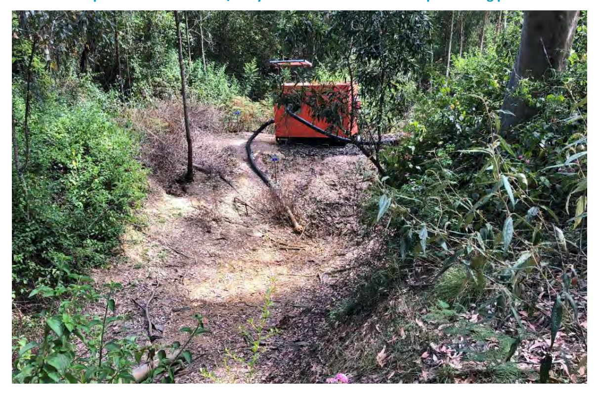
Photo 17 Pump at orange stain clean water drain – consider temporary bunding / spill management